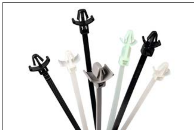
A wide range of arrowhead fixing ties which are suitable for different panel thicknesses and hole diameters.

Material specifications: See Article-No. on our website.